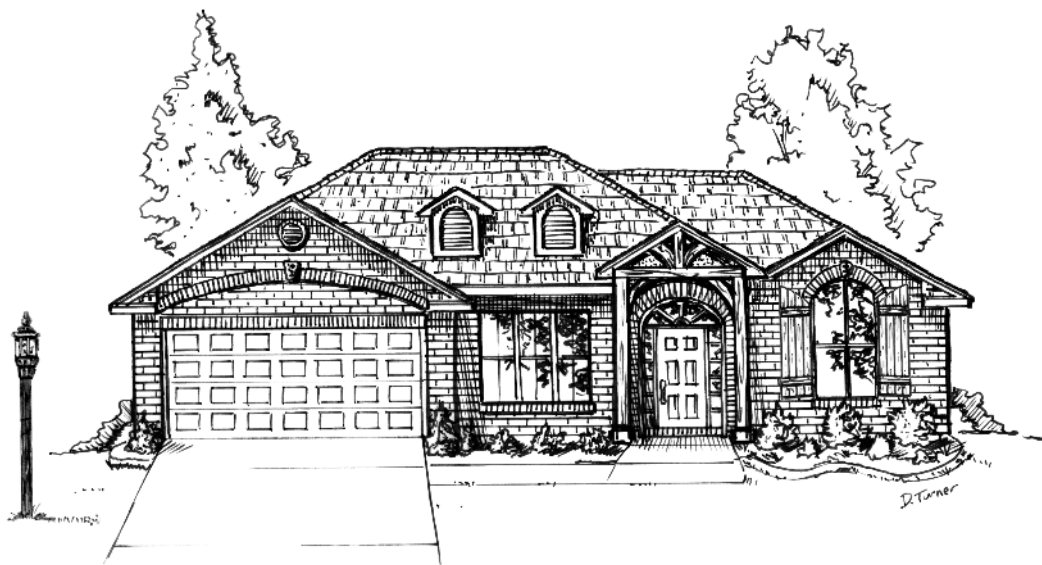
Elevation A (Optional dormers and cedar posts shown)