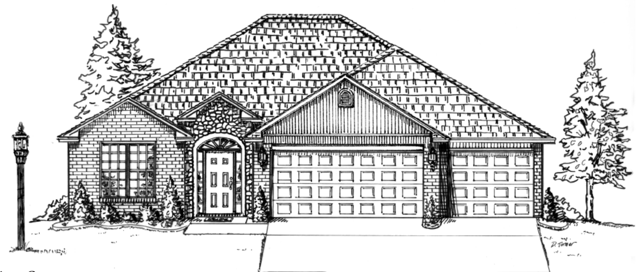
Elevation C (Optional rock shown)