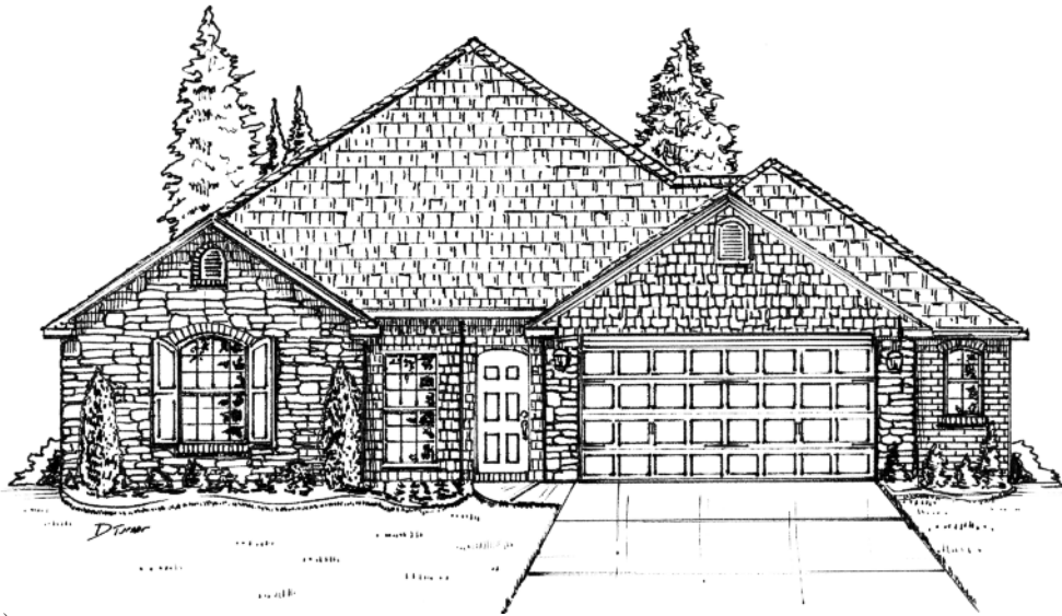
Elevation B (Optional rock shown)